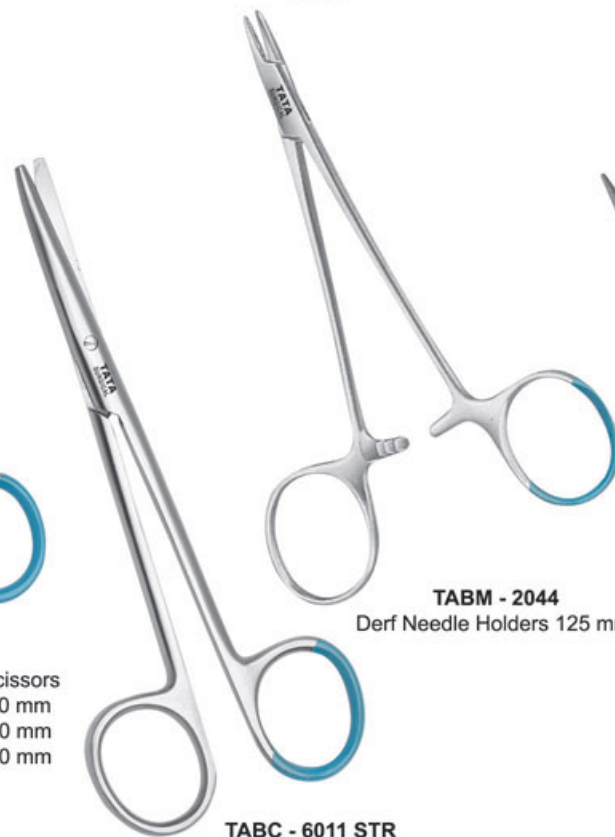
TABM - 2044 Derf Needle Holders 125 mm