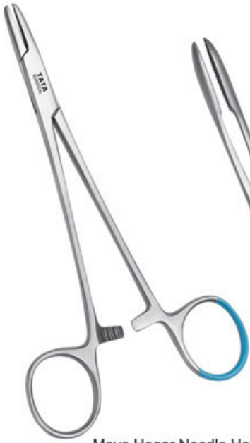
Mayo Hegar Needle Holders TABM - 2355/1 140 mm TABM - 2355 150 mm TABM - 2200 160 mm TABM - 2366 180 mm TABM - 2377 200 mm