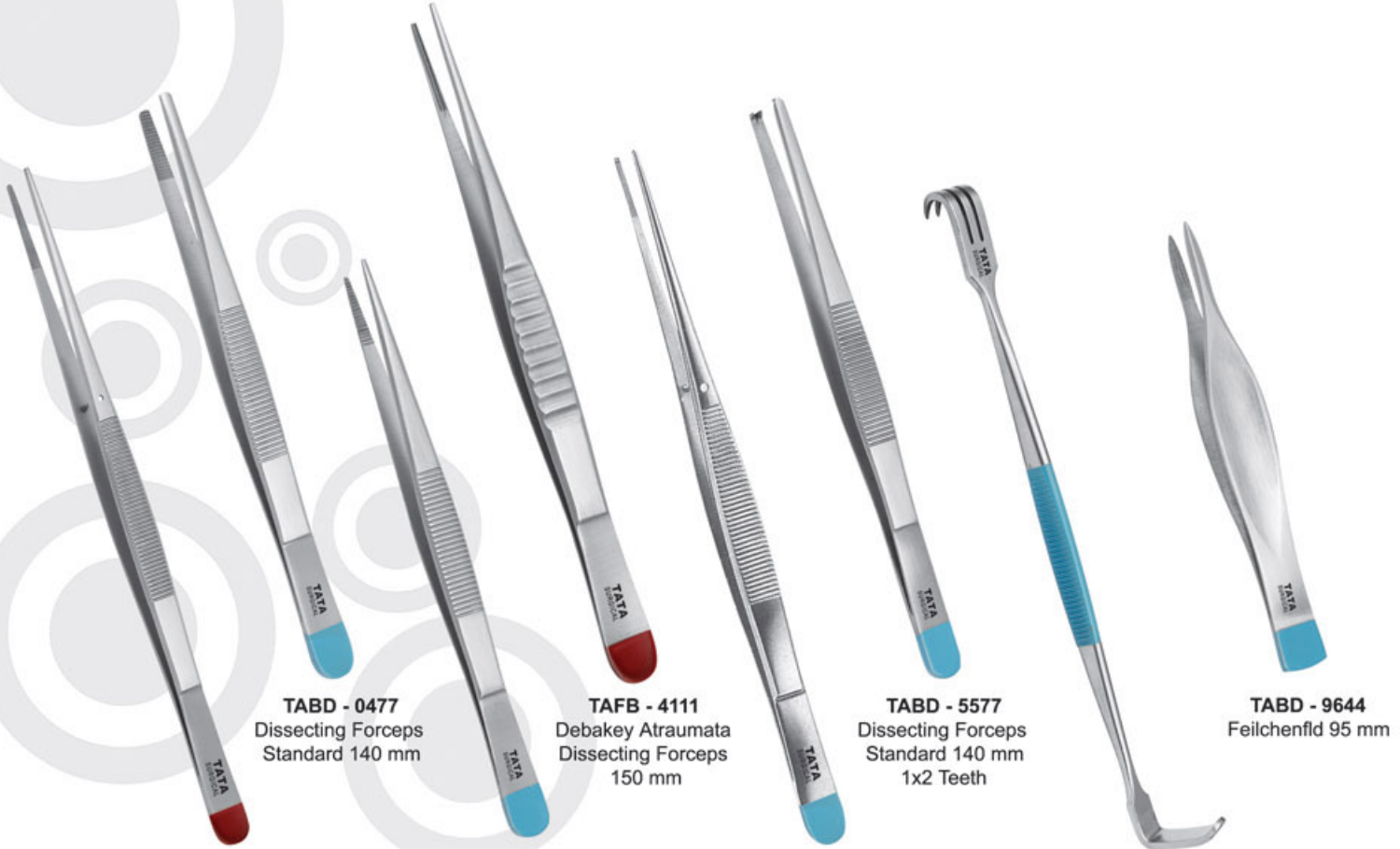
TABD - 0477 Dissecting Forceps Standard 140 mm