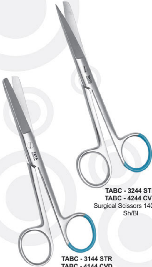
TABC - 3244 STR TABC - 4244 CVD Surgical Scissors 140 mm Sh/BI