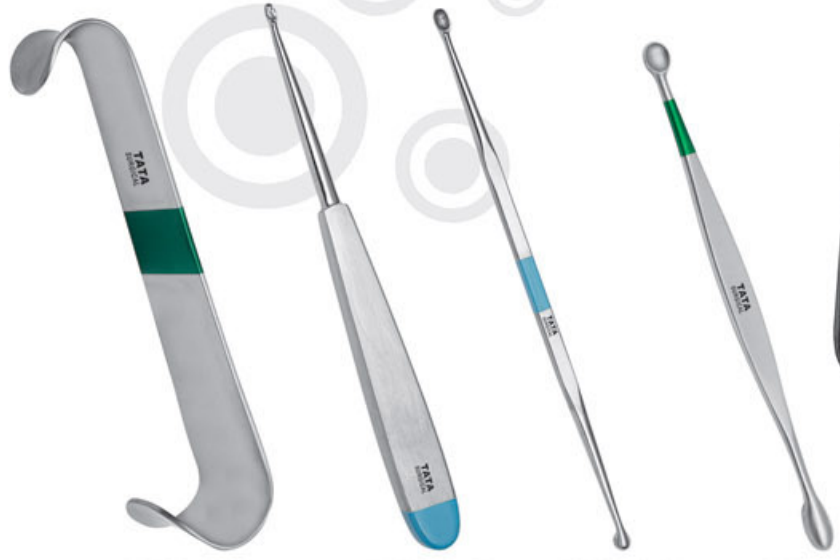
TABT - 0288 Roux Retractors 170 mm