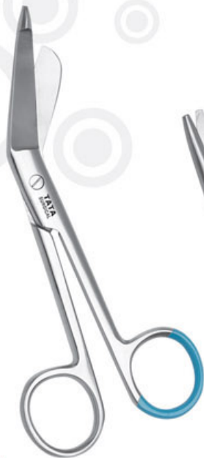
Lister Bangage Scissors TABC - 8611 140 mm TABC - 8622 180 mm TABC - 8633 200 mm