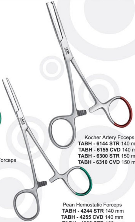
Kocher Artery Forceps TABH - 6144 STR 140 mm TABH - 6155 CVD 140 mm TABH - 6300 STR 150 mm TABH - 6310 CVD 150 mm