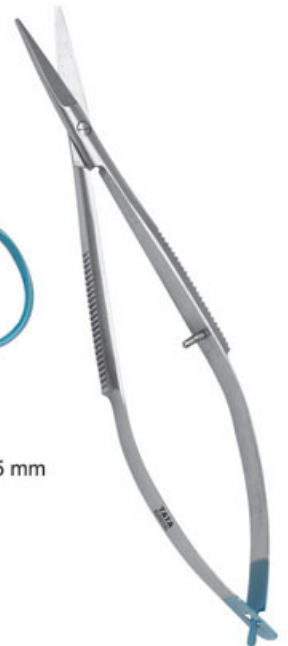
TAOC - 4822 Noyes Eye Scissors 125 mm