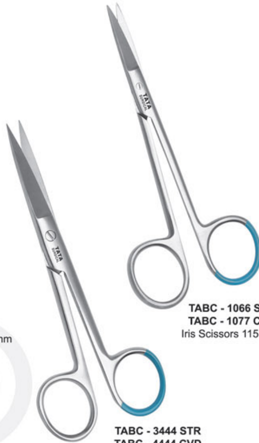
TABC - 1066 STR TABC - 1077 CVD Iris Scissors 115 mm