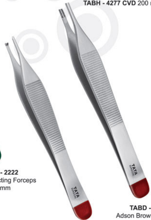
TABD - 7000 Adson Brown Forceps 120 mm