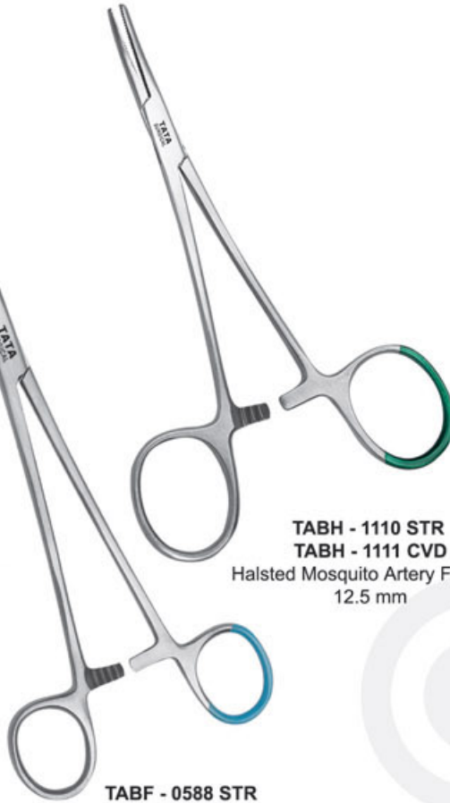
TABH - 1110 STR TABH - 1111 CVD Halsted Mosquito Artery Forceps 12.5 mm