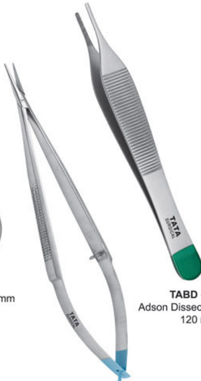
TABD - 2222 Adson Dissecting Forceps 120 mm