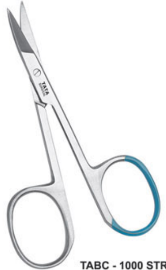
TABC - 1000 STR TABC - 1011 CVD Delicate Scissors 90 mm