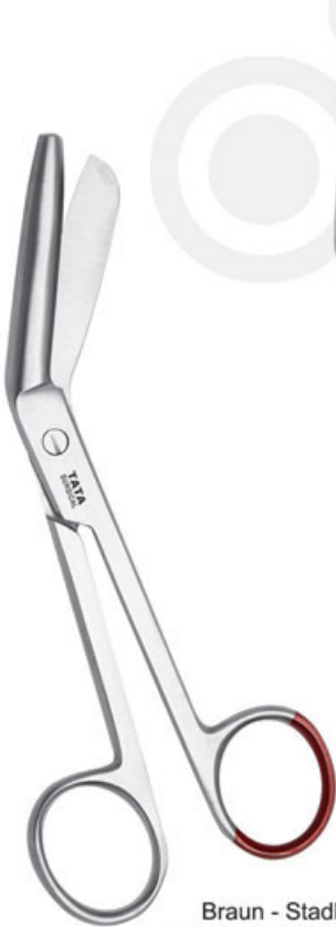
Braun - Stadler TAET - 1400 140 mm TAET - 1411 200 mm