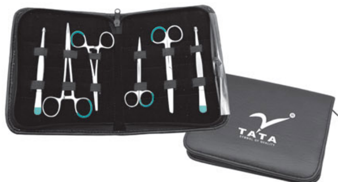
Single Use Dissecting Kit 6 PCS

TATA Surgical (Pvt) Ltd. Commissioner Road, Muhammad Pura, Sialkot - 51310 Pakistan. Tel: +92 (0) 52 458 04 21 - 22 Fax: +92 (0) 52 459 29 09, 459 54 90 E-mail: info@tata.com.pk URL: www.tatasurgical.com